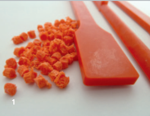
1 Coloured MouldPulp granulate and injected test specimen.