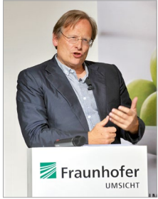
Prof. Dr. med. Dietrich Grönemeyer

"Just as in medicine, my point is to help make even complicated issues in science and technology easily understandable for a general public. It is a significant building block in helping to inspire the younger generation for science. That is why I very much appreciate that medial quality and general intelligibility associated with it are also applicable assessment criteria in the presentation of research."